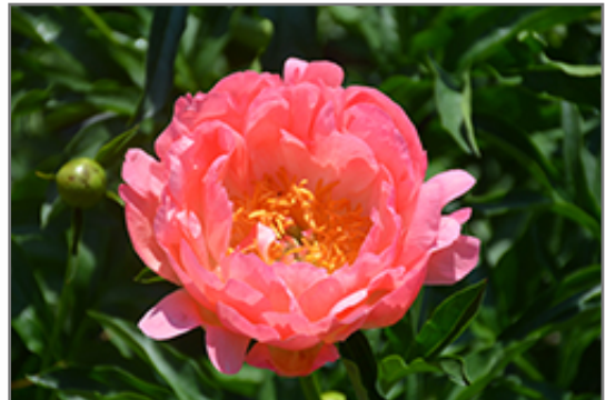
Coral Sunset Peony flowers