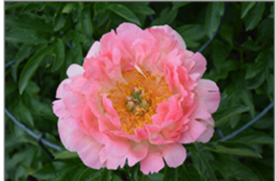
Coral Sunset Peony flowers (faded)