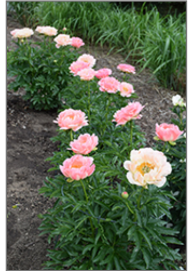
Coral Sunset Peony in bloom

This plant does best in full sun to partial shade. It does best in average to evenly moist conditions, but will not tolerate standing water. It is not particular as to soil pH, but grows best in rich soils. It is somewhat tolerant of urban pollution. This particular variety is an interspecific hybrid. It can be propagated by division; however, as a cultivated variety, be aware that it may be subject to certain restrictions or prohibitions on propagation.