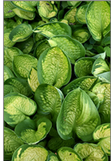
Rainforest Sunrise Hosta foliage