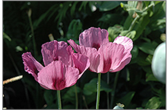
Patty's Plum Poppy flowers

This exquisite selection is sought after for good reason; the numerous six inch wide ruffled plum purple to lavender flowers display contrasting blotches and deep purple centers; stunning when massed in mid-border plantings