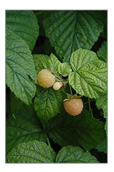
Fall Gold Raspberry fruit

This is an open multi-stemmed deciduous shrub with an upright spreading habit of growth. Its relatively coarse texture can be used to stand it apart from other landscape plants with finer foliage. This is a high maintenance plant that will require regular care and upkeep. Each spring, cut back all dead and two-year old canes to the ground, leaving only last year's growth standing. It is a good choice for attracting birds to your yard. Gardeners should be aware of the following characteristic(s) that may warrant special consideration;