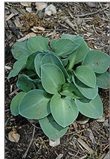
Blue Mouse Ears Hosta