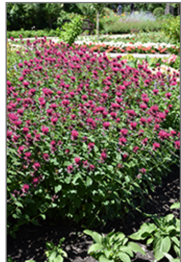
Raspberry Wine Beebalm in bloom