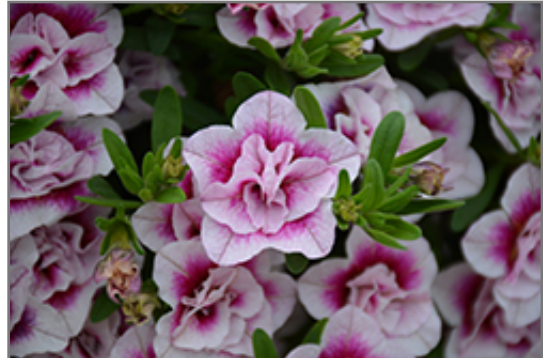
MiniFamous Uno Double PinkTastic Calibrachoa flowers

MiniFamous Uno Double PinkTastic Calibrachoa is a dense herbaceous annual with a trailing habit of growth, eventually spilling over the edges of hanging baskets and containers. Its medium texture blends into the garden, but can always be balanced by a couple of finer or coarser plants for an effective composition.