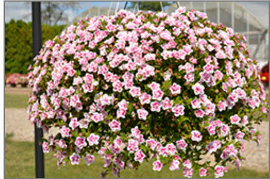
MiniFamous Uno Double PinkTastic Calibrachoa in bloom