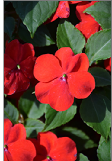
Beacon Bright Red Impatiens flowers

Beacon Bright Red Impatiens is recommended for the following landscape applications;