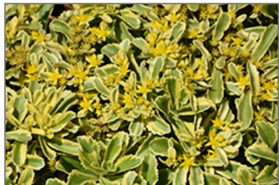
Cutting Edge Stonecrop flowers