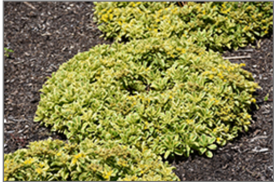
Cutting Edge Stonecrop

Cutting Edge Stonecrop is a fine choice for the garden, but it is also a good selection for planting in outdoor pots and containers. It is often used as a 'filler' in the 'spiller-thriller-filler' container combination, providing a mass of flowers and foliage against which the thriller plants stand out. Note that when growing plants in outdoor containers and baskets, they may require more frequent waterings than they would in the yard or garden. Be aware that in our climate, most plants cannot be expected to survive the winter if left in containers outdoors, and this plant is no exception. Contact our experts for more information on how to protect it over the winter months.