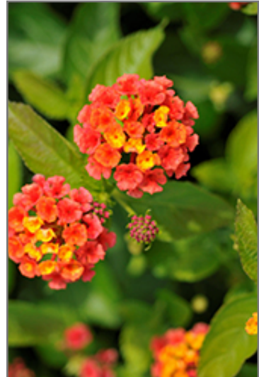
Landscape Bandana Red Lantana flowers

Landscape Bandana Red Lantana is recommended for the following landscape applications;