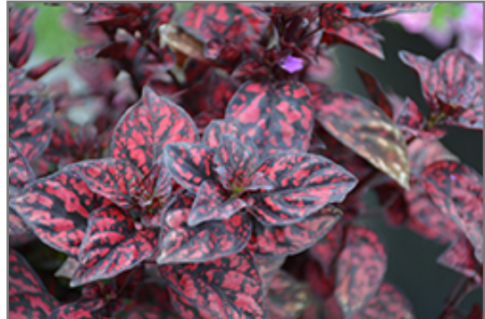
Hippo Red Polka Dot Plant foliage

Hippo Red Polka Dot Plant is recommended for the following landscape applications;