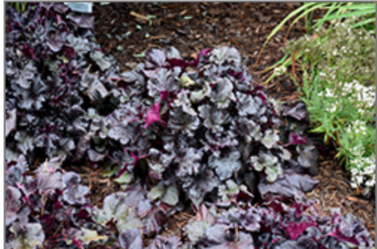
Black Pearl Coral Bells

Black Pearl Coral Bells will grow to be about 10 inches tall at maturity extending to 20 inches tall with the flowers, with a spread of 26 inches. When grown in masses or used as a bedding plant, individual plants should be spaced approximately 20 inches apart. Its foliage tends to remain low and dense right to the ground. It grows at a medium rate, and under ideal conditions can be expected to live for approximately 10 years. As an evergreen perennial, this plant will typically keep its form and foliage year-round.