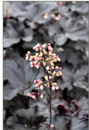
Black Pearl Coral Bells flowers