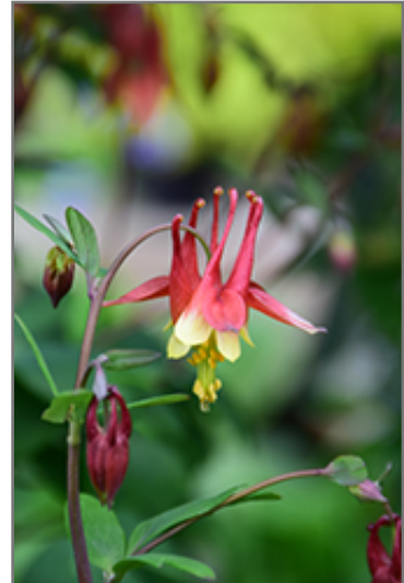
Wild Red Columbine flowers