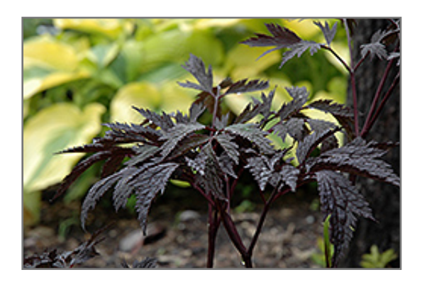
Chocoholic Bugbane foliage