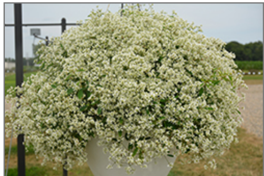
Stardust Super Flash Euphorbia in bloom