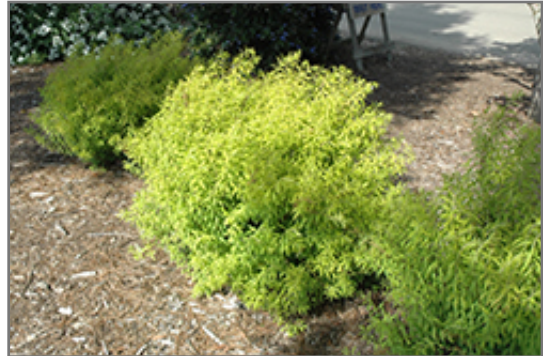
Mellow Yellow Spirea

This is a high maintenance shrub that will require regular care and upkeep, and should only be pruned after flowering to avoid removing any of the current season's flowers. It is a good choice for attracting butterflies to your yard, but is not particularly attractive to deer who tend to leave it alone in favor of tastier treats. It has no significant negative characteristics.