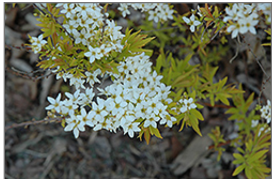
Mellow Yellow Spirea flowers