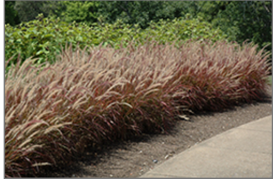
Purple Fountain Grass in bloom

Purple Fountain Grass will grow to be about 4 feet tall at maturity, with a spread of 3 feet. Although it's not a true annual, this plant can be expected to behave as an annual in our climate if left outdoors over the winter, usually needing replacement the following year. As such, gardeners should take into consideration that it will perform differently than it would in its native habitat.