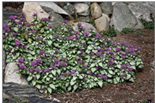
Purple Dragon Spotted Dead Nettle in bloom