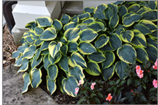
First Frost Hosta

First Frost Hosta will grow to be about 10 inches tall at maturity extending to 18 inches tall with the flowers, with a spread of 3 feet. When grown in masses or used as a bedding plant, individual plants should be spaced approximately 30 inches apart. Its foliage tends to remain low and dense right to the ground. It grows at a medium rate, and under ideal conditions can be expected to live for approximately 10 years. As an herbaceous perennial, this plant will usually die back to the crown each winter, and will regrow from the base each spring. Be careful not to disturb the crown in late winter when it may not be readily seen!