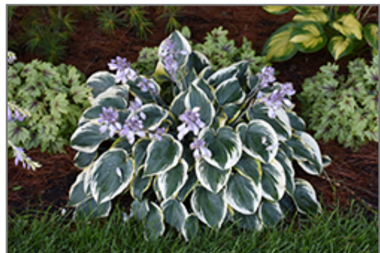
First Frost Hosta in bloom