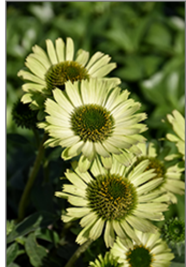
Green Jewel Coneflower flowers

Green Jewel Coneflower is recommended for the following landscape applications;