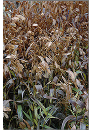
Northern Sea Oats in fall

Northern Sea Oats is recommended for the following landscape applications;