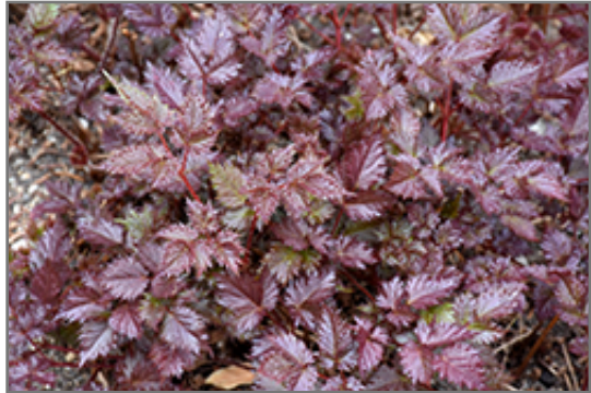
Delft Lace Astilbe foliage