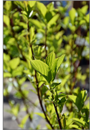
Bailey Red-Twig Dogwood foliage

This shrub does best in full sun to partial shade. It is an amazingly adaptable plant, tolerating both dry conditions and even some standing water. It is not particular as to soil type or pH. It is highly tolerant of urban pollution and will even thrive in inner city environments. This species is native to parts of North America.