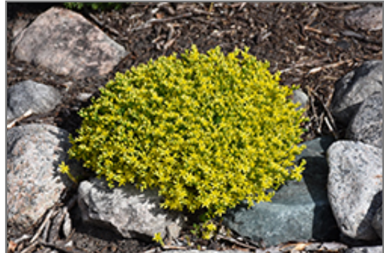
Golden Moss Stonecrop in bloom

Golden Moss Stonecrop is recommended for the following landscape applications;