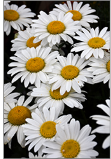
Snowcap Shasta Daisy flowers

A delightful variety of the ever-popular shasta daisy known for a high bloom rate; abundant beautiful white blooms with yellow eyes rise above and graciously contrast the deep green foliage; wonderful choice to mass as a garden focal point