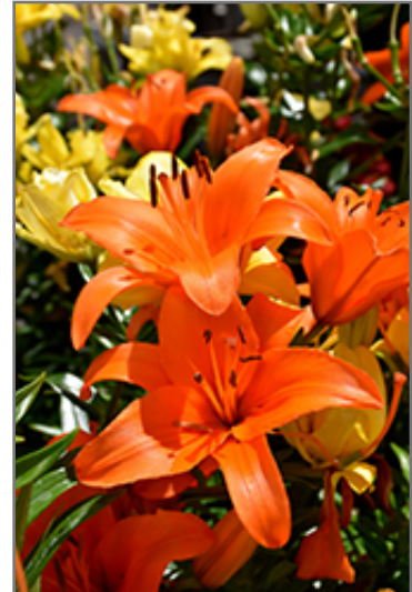
Brunello Lily flowers