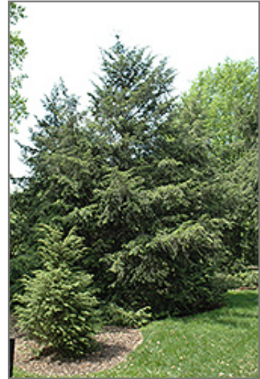
Canadian Hemlock

Canadian Hemlock is recommended for the following landscape applications;