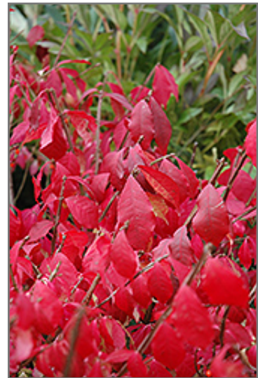
Burning Bush (tree form) in fall