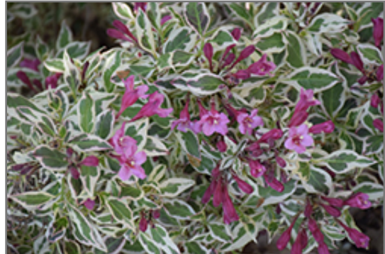
My Monet Weigela flowers

My Monet Weigela is recommended for the following landscape applications;