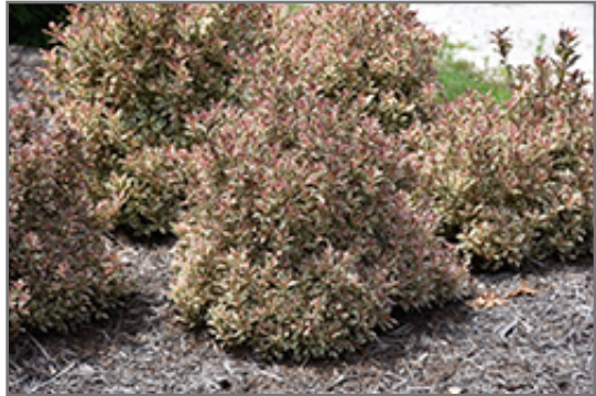
My Monet Weigela

My Monet Weigela makes a fine choice for the outdoor landscape, but it is also well-suited for use in outdoor pots and containers. It is often used as a 'filler' in the 'spiller-thriller-filler' container combination, providing a mass of flowers and foliage against which the thriller plants stand out. Note that when grown in a container, it may not perform exactly as indicated on the tag - this is to be expected. Also note that when growing plants in outdoor containers and baskets, they may require more frequent waterings than they would in the yard or garden. Be aware that in our climate, most plants cannot be expected to survive the winter if left in containers outdoors, and this plant is no exception. Contact our experts for more information on how to protect it over the winter months.