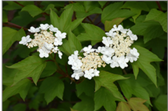
Redwing Highbush Cranberry flowers