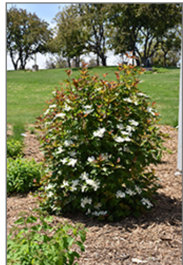
Redwing Highbush Cranberry in bloom