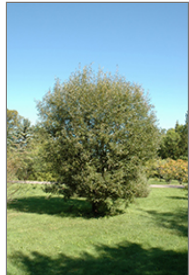
Pussy Willow