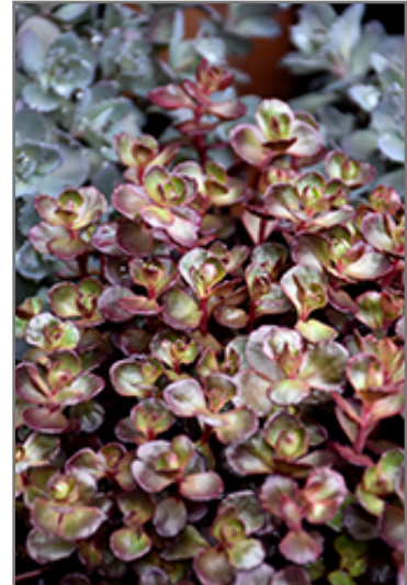
Voodoo Stonecrop foliage

Voodoo Stonecrop is recommended for the following landscape applications;