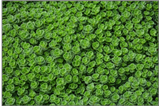
John Creech Stonecrop foliage

John Creech Stonecrop will grow to be only 3 inches tall at maturity, with a spread of 12 inches. When grown in masses or used as a bedding plant, individual plants should be spaced approximately 10 inches apart. Its foliage tends to remain low and dense right to the ground. It grows at a fast rate, and under ideal conditions can be expected to live for approximately 10 years. As an herbaceous perennial, this plant will usually die back to the crown each winter, and will regrow from the base each spring. Be careful not to disturb the crown in late winter when it may not be readily seen!