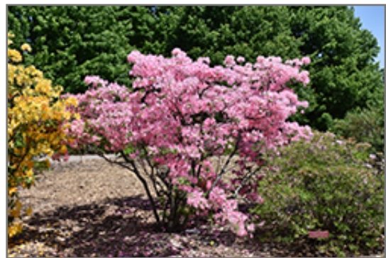
Northern Lights Azalea in bloom