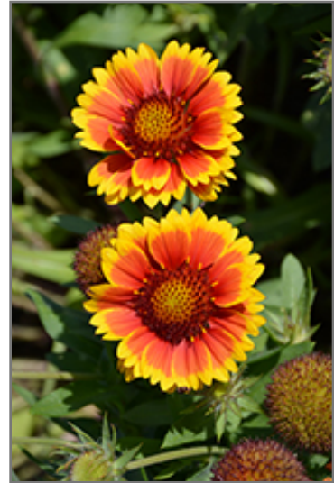
Arizona Sun Blanket Flower flowers

Arizona Sun Blanket Flower is recommended for the following landscape applications;