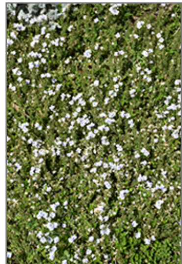
Snowmass Blue-Eyed Veronica in bloom