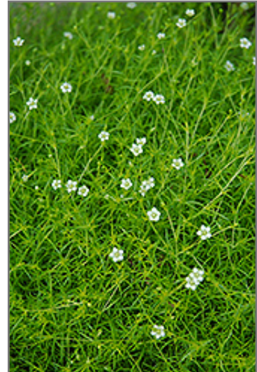
Scotch Moss flowers