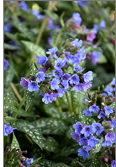
Trevi Fountain Lungwort flowers