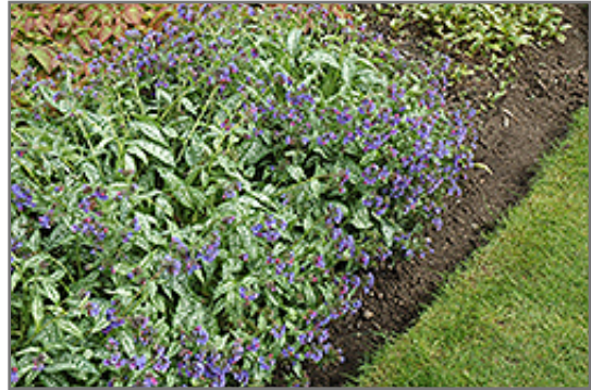
Trevi Fountain Lungwort in bloom

Trevi Fountain Lungwort will grow to be about 12 inches tall at maturity, with a spread of 18 inches. When grown in masses or used as a bedding plant, individual plants should be spaced approximately 15 inches apart. Its foliage tends to remain dense right to the ground, not requiring facer plants in front. It grows at a medium rate, and under ideal conditions can be expected to live for approximately 10 years. As an herbaceous perennial, this plant will usually die back to the crown each winter, and will regrow from the base each spring. Be careful not to disturb the crown in late winter when it may not be readily seen!