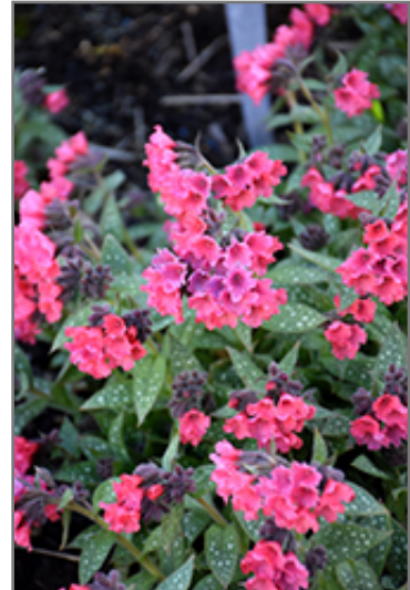
Shrimps On The Barbie Lungwort flowers

This is a relatively low maintenance plant, and should be cut back in late fall in preparation for winter. It is a good choice for attracting bees, butterflies and hummingbirds to your yard, but is not particularly attractive to deer who tend to leave it alone in favor of tastier treats. It has no significant negative characteristics.