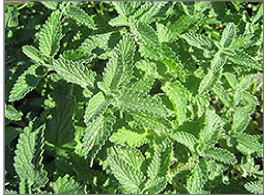
Walker's Low Catmint foliage

Walker's Low Catmint will grow to be about 12 inches tall at maturity extending to 16 inches tall with the flowers, with a spread of 12 inches. Its foliage tends to remain dense right to the ground, not requiring facer plants in front. It grows at a fast rate, and under ideal conditions can be expected to live for approximately 10 years. As an herbaceous perennial, this plant will usually die back to the crown each winter, and will regrow from the base each spring. Be careful not to disturb the crown in late winter when it may not be readily seen!