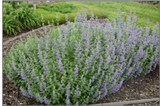
Walker's Low Catmint in bloom

Walker's Low Catmint is recommended for the following landscape applications;