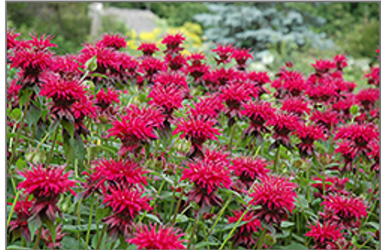
Raspberry Wine Beebalm flowers