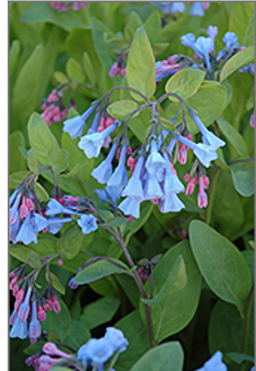
Virginia Bluebells flowers