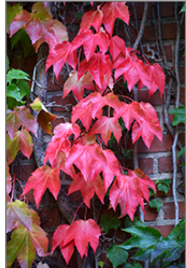
Boston Ivy in fall