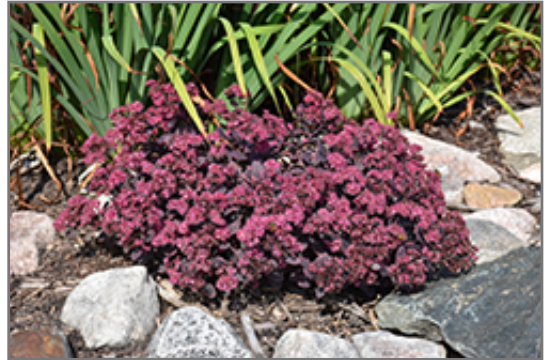
Dream Dazzler Stonecrop in bloom