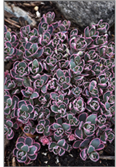
Dream Dazzler Stonecrop foliage

Dream Dazzler Stonecrop is a dense herbaceous perennial with an upright spreading habit of growth. Its medium texture blends into the garden, but can always be balanced by a couple of finer or coarser plants for an effective composition.