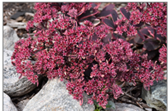
Dream Dazzler Stonecrop flowers