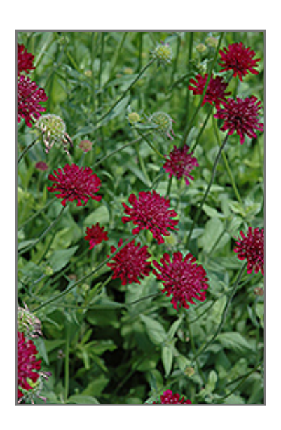
Crimson Scabious flowers

Crimson Scabious will grow to be about 24 inches tall at maturity extending to 3 feet tall with the flowers, with a spread of 24 inches. It tends to be leggy, with a typical clearance of 1 foot from the ground, and should be underplanted with lower-growing perennials. It grows at a fast rate, and under ideal conditions can be expected to live for approximately 3 years. As an herbaceous perennial, this plant will usually die back to the crown each winter, and will regrow from the base each spring. Be careful not to disturb the crown in late winter when it may not be readily seen!