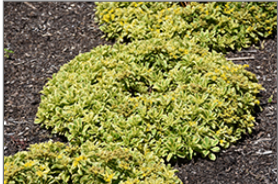
Cutting Edge Stonecrop

Cutting Edge Stonecrop is a fine choice for the garden, but it is also a good selection for planting in outdoor pots and containers. It is often used as a 'filler' in the 'spiller-thriller-filler' container combination, providing a mass of flowers and foliage against which the thriller plants stand out. Note that when growing plants in outdoor containers and baskets, they may require more frequent waterings than they would in the yard or garden. Be aware that in our climate, most plants cannot be expected to survive the winter if left in containers outdoors, and this plant is no exception. Contact our experts for more information on how to protect it over the winter months.