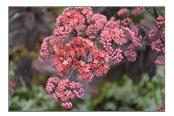
Night Embers Stonecrop flowers