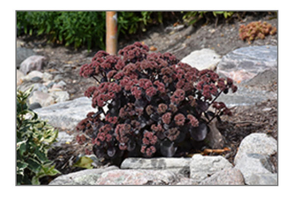
Night Embers Stonecrop in bloom

Night Embers Stonecrop is a dense herbaceous perennial with an upright spreading habit of growth. Its relatively coarse texture can be used to stand it apart from other garden plants with finer foliage.