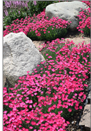
Paint The Town Magenta Pinks in bloom

Paint The Town Magenta Pinks is an herbaceous evergreen perennial with a mounded form. It brings an extremely fine and delicate texture to the garden composition and should be used to full effect.