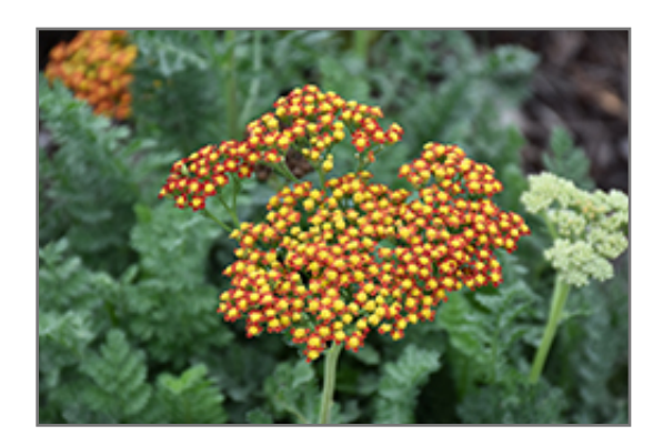
Sassy Summer Sunset Yarrow flowers

Sassy Summer Sunset Yarrow is recommended for the following landscape applications;