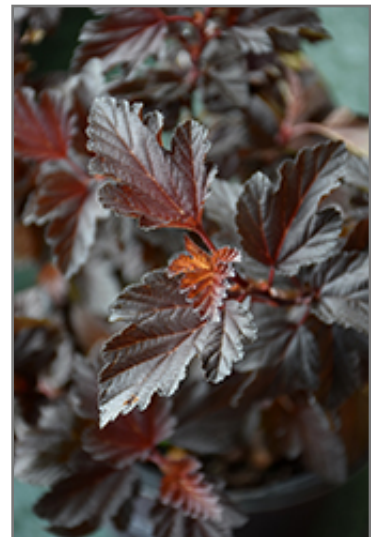
Fireside Ninebark flowers